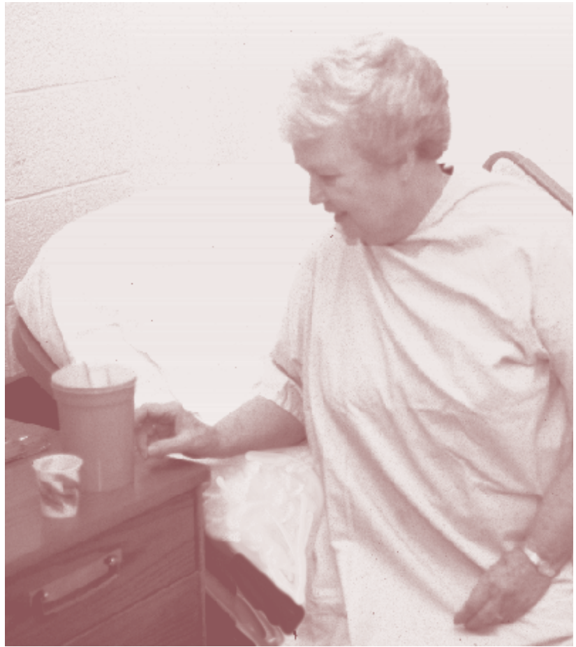
Patients may not understand use of familiar objects.